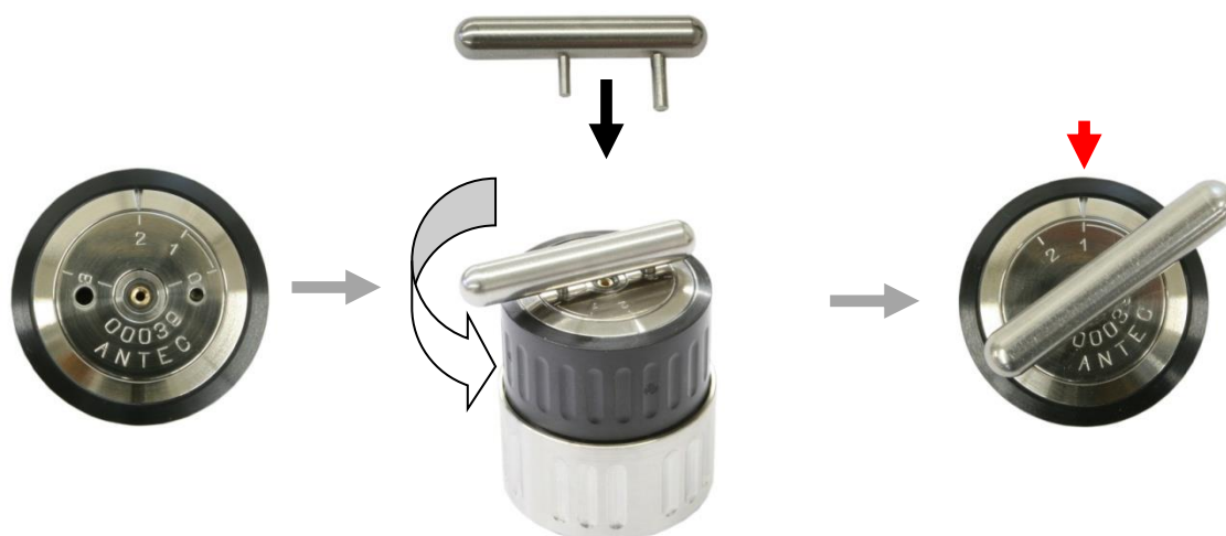
Fig 2. Adjustment of the working volume from position 2 (left side) to 1 (right side).

To adjust the working volume from position 2 to 1: