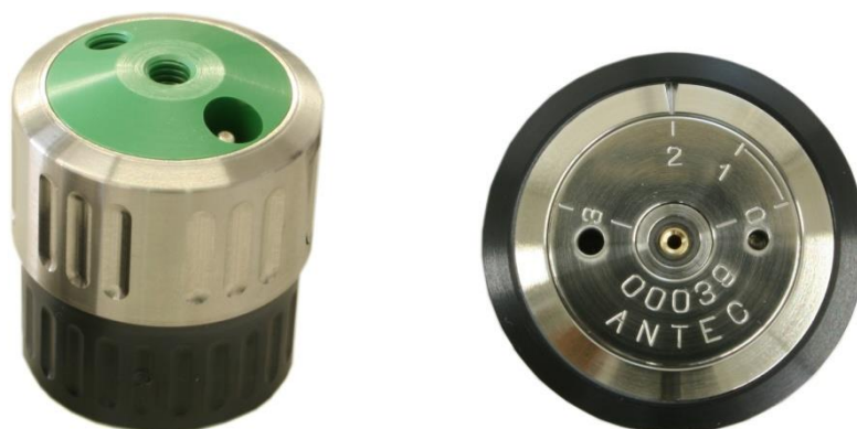
Fig 1. Left side : photo of assembled SenCell inlet block (green) with In-Situ Ag/AgCl (ISAAC) reference electrode (REF). Right side : bottom side of the SenCell with the Cell working volume adjustment system, Auxiliary(AUX) electrode contact (opening on left side next to inscription '3') and Working electrode (WE) contact (opening in the center).

The SenCell is delivered pre-assembled and ready for installation and use.