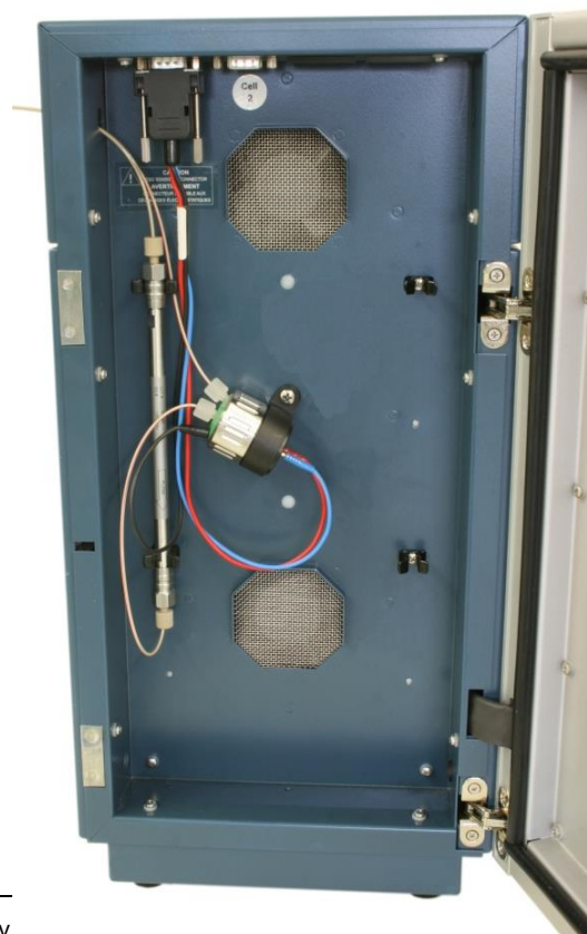
Fig 4. Installation of SenCell in DECADE II detector: photograph of DECADE II oven compartment with column and SenCell installed.

Copyright ©2021 Antec. All rights reserved. Contents of this publication may (including electronic storage and retrieval or translation into a foreign language) without prior agreement and written consent from the copyright of the owner. The information contained in this document is subject to change without notice. The information provided herein is believed to be reliable. Antec shall not be liable for errors contained herein or for incidental or consequential damages in connection with the furnishing, performance, or use of this manual. All use of the hardware shall be entirely at the user's own risk.